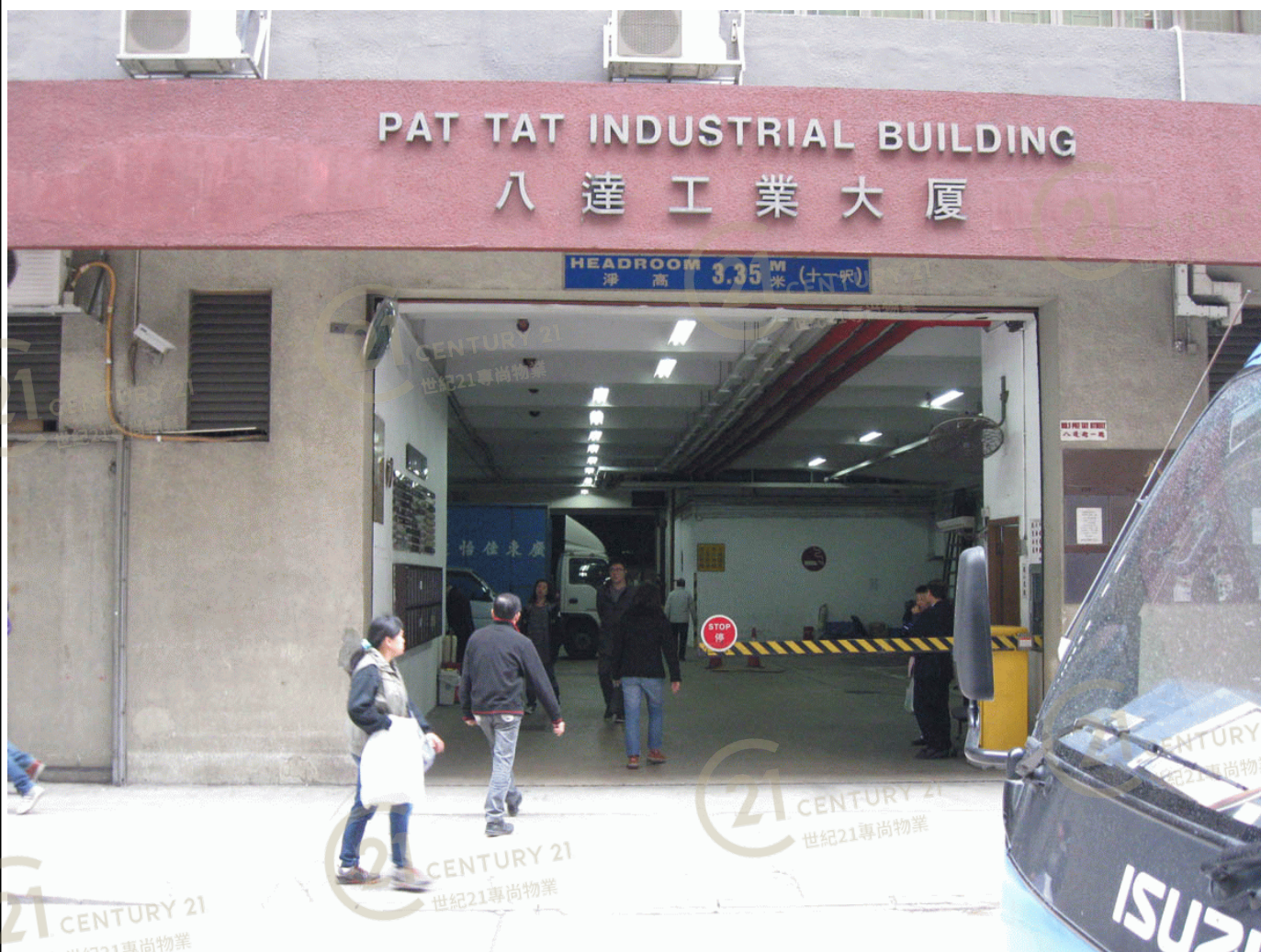
八達工業大廈 Pat Tat Industrial Building

NOT TO SCALE, FOR IDENTIFICATION PURPOSE ONLY