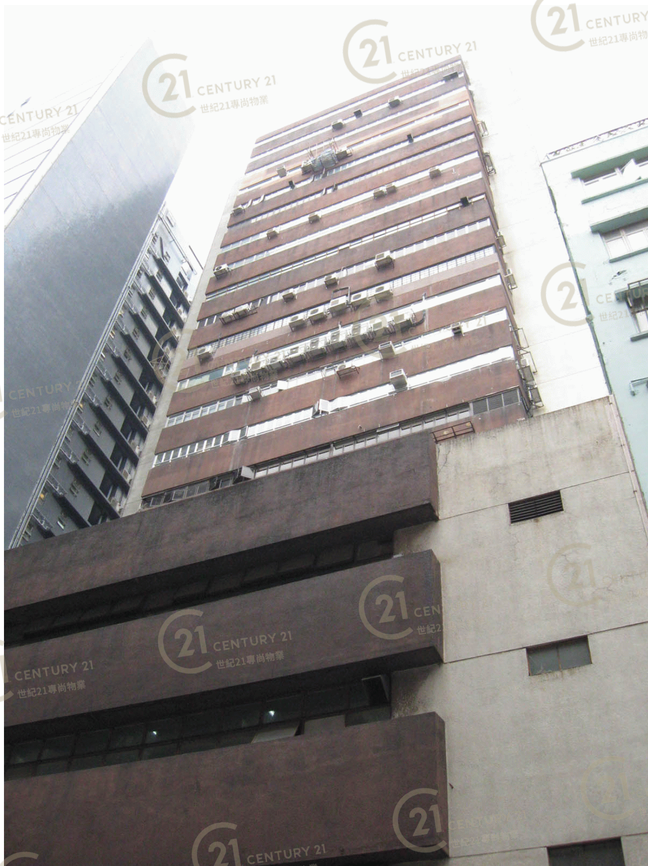
八達工業大廈 Pat Tat Industrial Building

NOT TO SCALE, FOR IDENTIFICATION PURPOSE ONLY