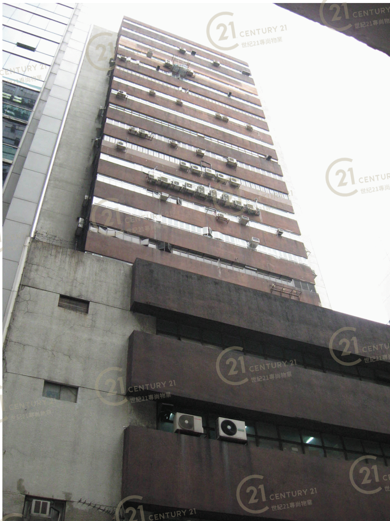
八達工業大廈 Pat Tat Industrial Building

NOT TO SCALE, FOR IDENTIFICATION PURPOSE ONLY